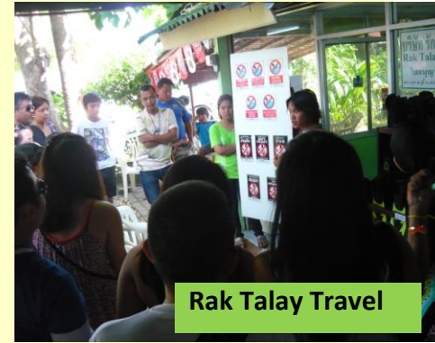
Rak Talay Travel

Greenfins volunteers had conducted the assessment of skin diving entrepreneurs in Phuket by joining one day trip with six skin diving entrepreneurs. The assessment consists of observing , data collecting, interviewing tour guides and tourists about problems occurred from Marine tours operation and heeding the dive entrepreneurs' advice so Greenfins will improve its performance to the better level.