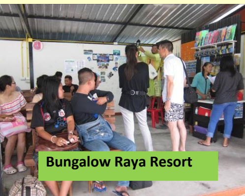
Bungalow Raya Resort

Greenfins joined the dive trip with Raya Father on May 28, 2014 at Raya Island. Thereafter, Greenfins joined the dive trip with Raya Princess Tour on June 4, 2014 at Raya Island. On June 11, 2014, we also joined the dive trip with Rak Talay Travel at PP Island and Koh Kai Nai. On June 14, 2014, we also had a chance to join the dive trip with Bungalow Raya Resort at Raya Island. On the next day, June 15, 2014, we joined the dive trip with Andavaree Travel at PP Island and Koh Kai Nai. And on the last day of assessment, June 18, 2014, we joined the dive trip with Golden Region Travel at Raya Island.