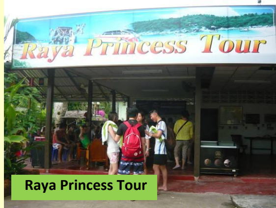
Raya Princess Tour