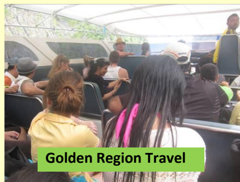
Golden Region Travel